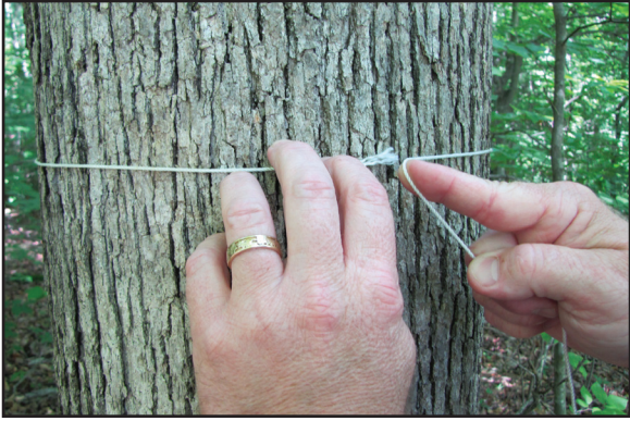
Strings or flexible measuring tape can be used to measure tree diameter. Wrap the string or measuring tape around the tree and divide the length in inches by 3.14 ( \pi ) to obtain a good estimate of tree diameter.